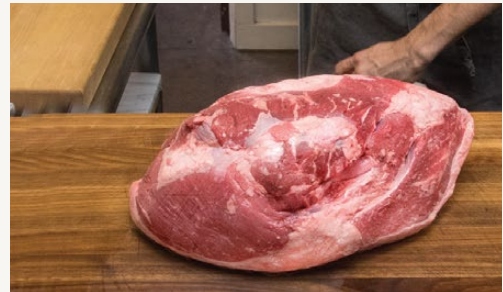
Look at All the Waste!