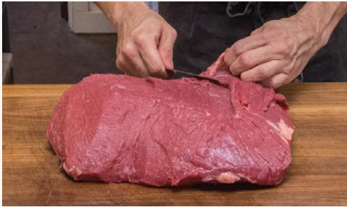
Very Clean !