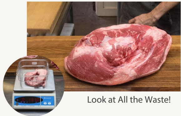
Look at All the Waste!