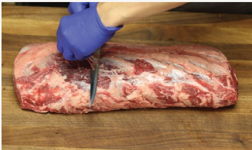
Ready to Portion Right Out of the Bag!