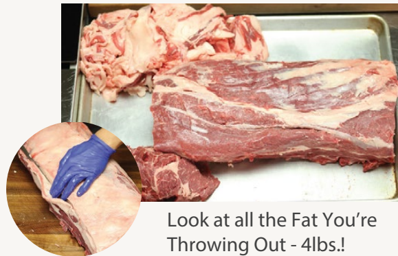
Look at all the Fat You're Throwing Out - 4lbs.!